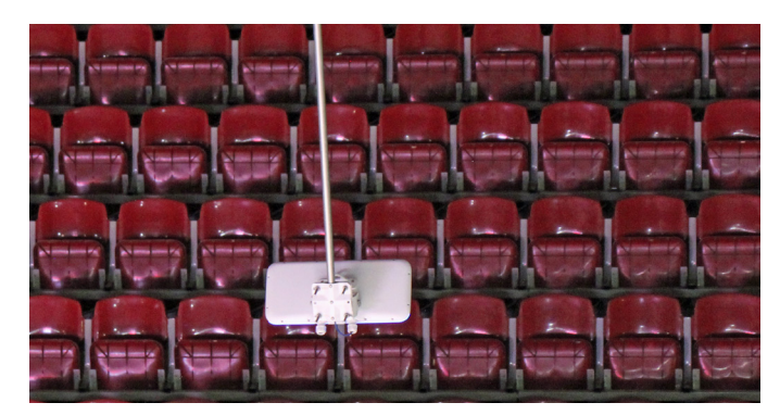
UniFi BaseStation XG facing seats

Fourteen UniFi BaseStation XG devices are installed throughout the arena to provide free Wi-Fi to attendees and POS Wi-Fi to the EFPOS/POS terminals courtside and in the seating areas.