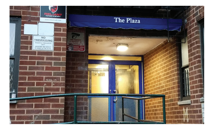
Installation site: The Plaza