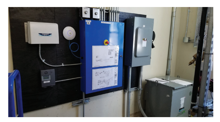
UniFi AC Lite AP mounted on a wall panel

The APs are monitored and managed by the UniFi Controller software, which conducts device discovery, provisioning, and configuration of UniFi devices via a web browser or the UniFi mobile app. Aegis uses a cloud server for remote access of the UniFi Controller software and also keeps a backup on a UniFi Cloud Key.