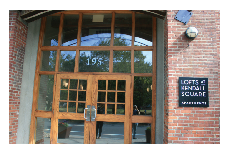
Installation site: Lofts at Kendall Square

Headquartered in Holyoke, Massachusetts, Aegis now has nearly a thousand CHP system installations throughout the East Coast, at various types of sites, including multi-unit residences, healthcare facilities, recreational centers, hotel properties, school campuses, military establishments, and pharmaceutical buildings.